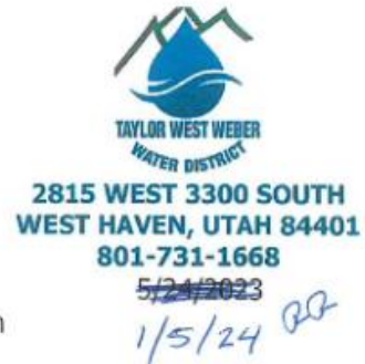
Exhibit B: Ability to serve letters

Weber County Planning Commission 2380 Washington Boulevard Ogden, Utah 84401