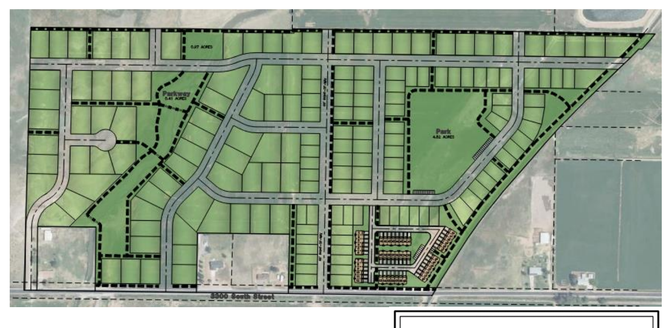
Exhibit A: Concept Plan & Narrative.